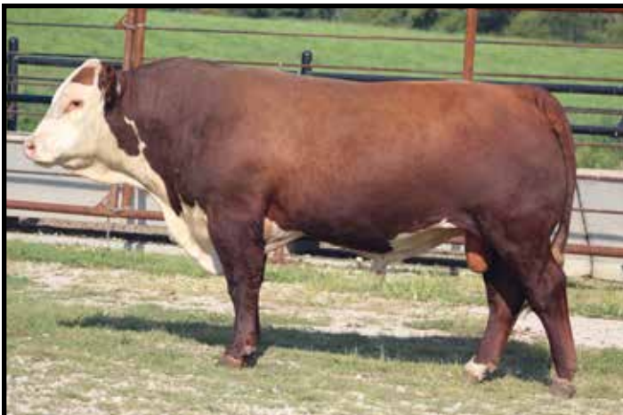
Lot 5 — MCC Masterplan 2211