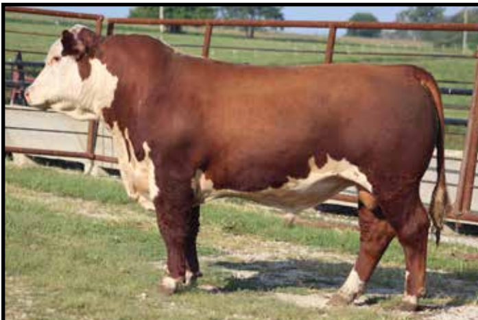
Lot 11 — MCC Masterplan 2217