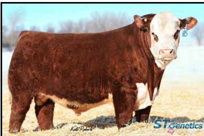
TH Masterplan 183F — Featured Sire