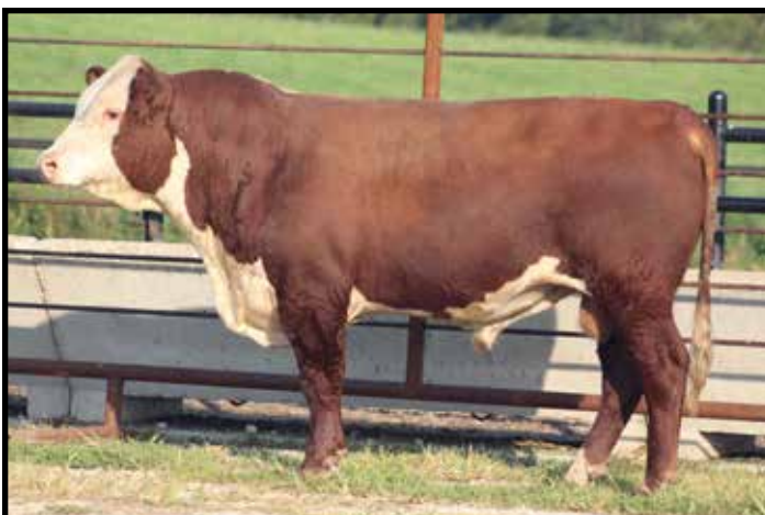
Lot 12 — MCC Masterplan 2225