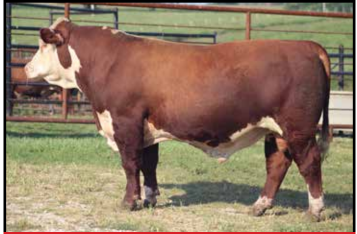
Lot 7 — MCC Maverick 2218