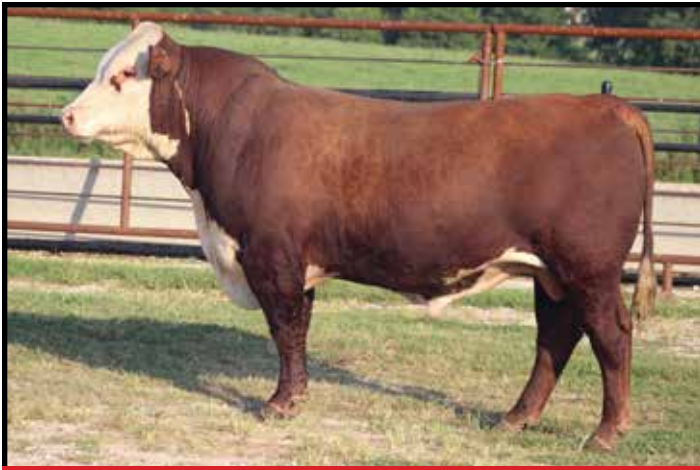
Lot 4 — MCC Banner 2231