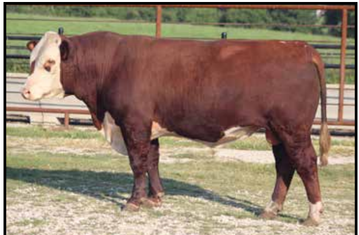
Lot 9 — MCC Advance 2237