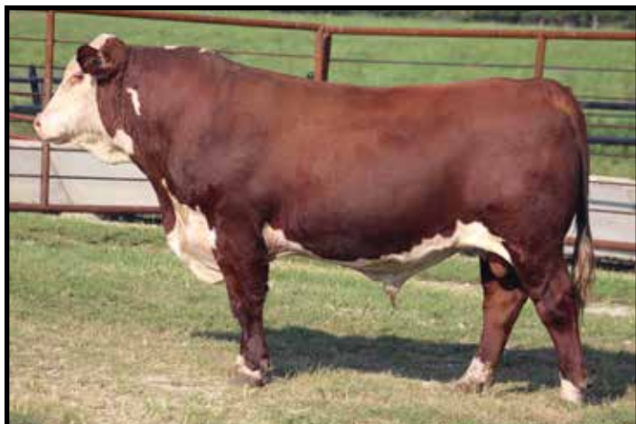
Lot 1 — MCC Basin 2201