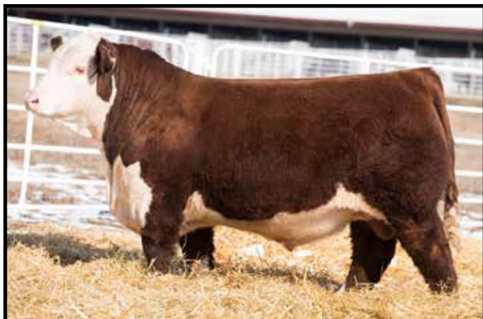
TH 13Y 358C Bottom Line 206E — Featured Sire