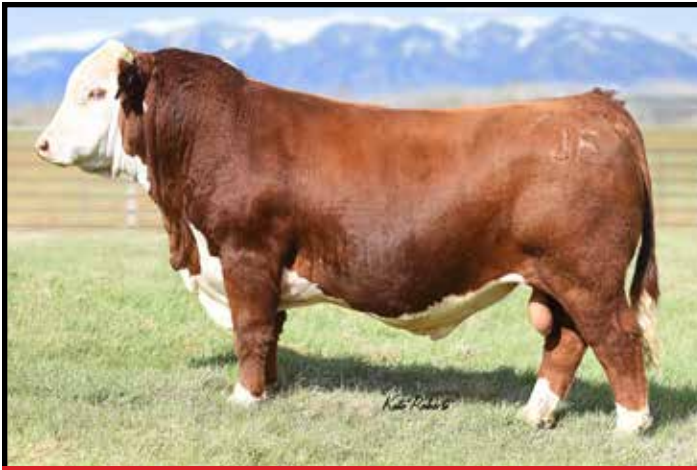
NJW Long Haul 36E ET — Featured Sire