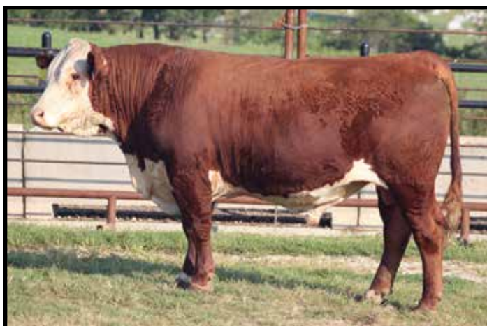
Lot 14 — MCC Bottomline 2210