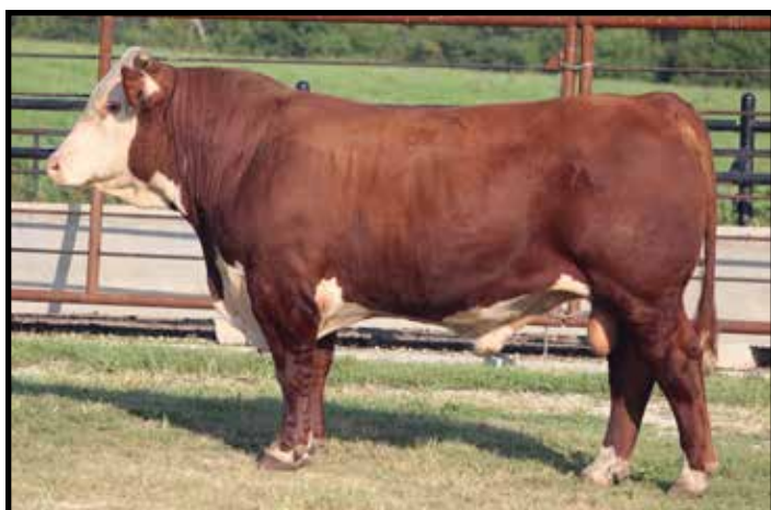
Lot 3 — MCC Bottomline 2241