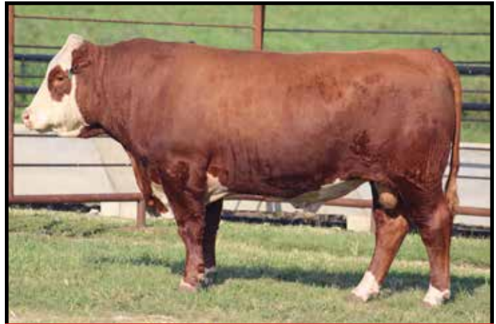
Lot 8 — MCC Masterplan 2209